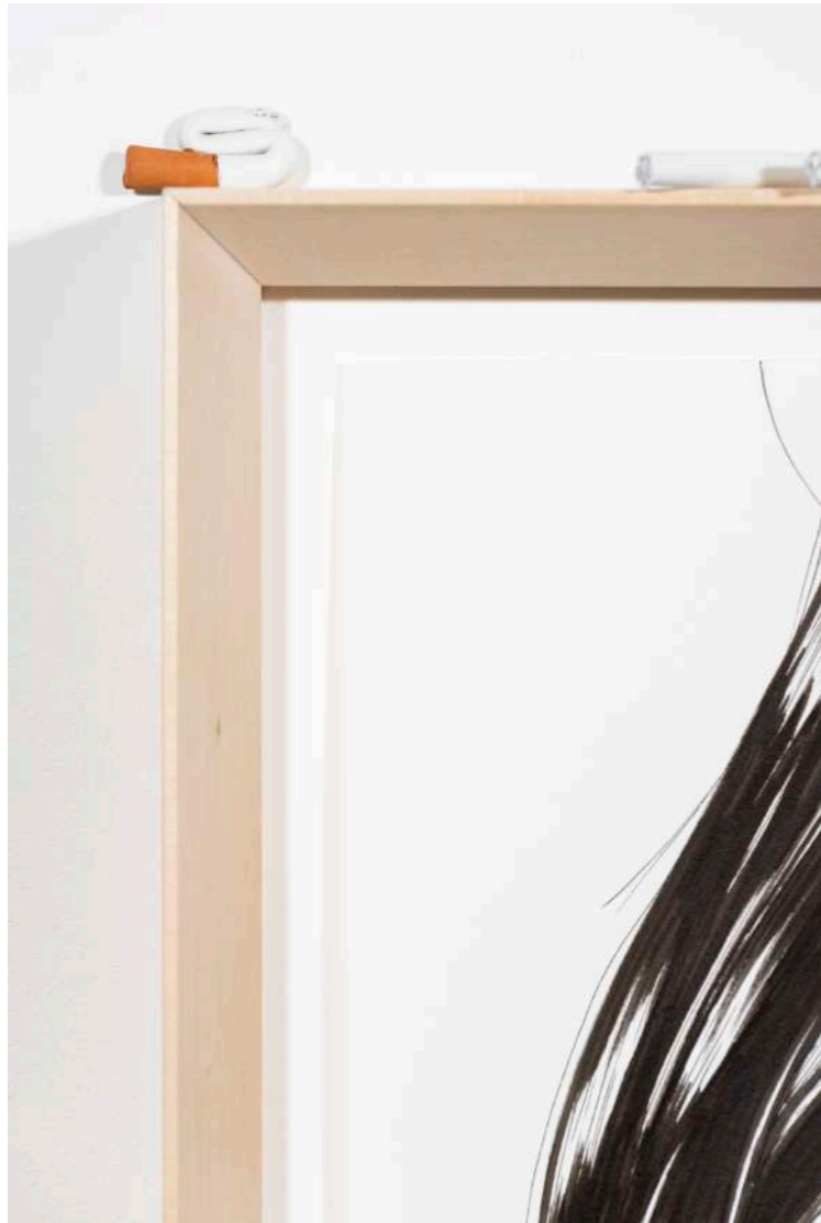
Falling hair (details) , 2021 ink on paper, glass, clay 48,7x36,6x6 cm