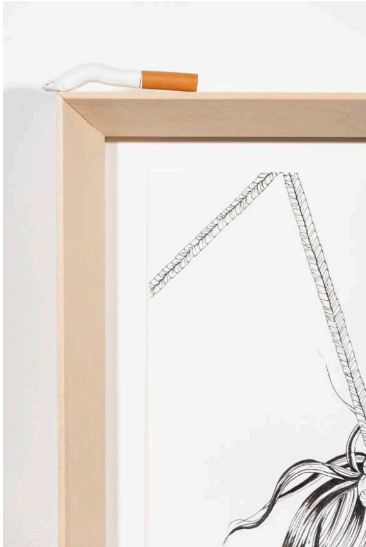
Untitled (Asanawa) (details), 2021 ink on paper, glass, clay 48,7x36,6x6 cm