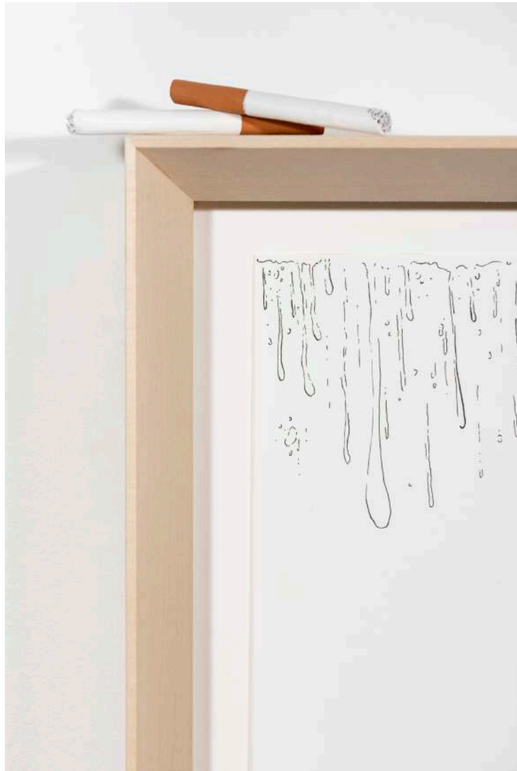
Cold sweat (details) , 2021 ink on paper, glass, clay 48,7x36,6x6 cm